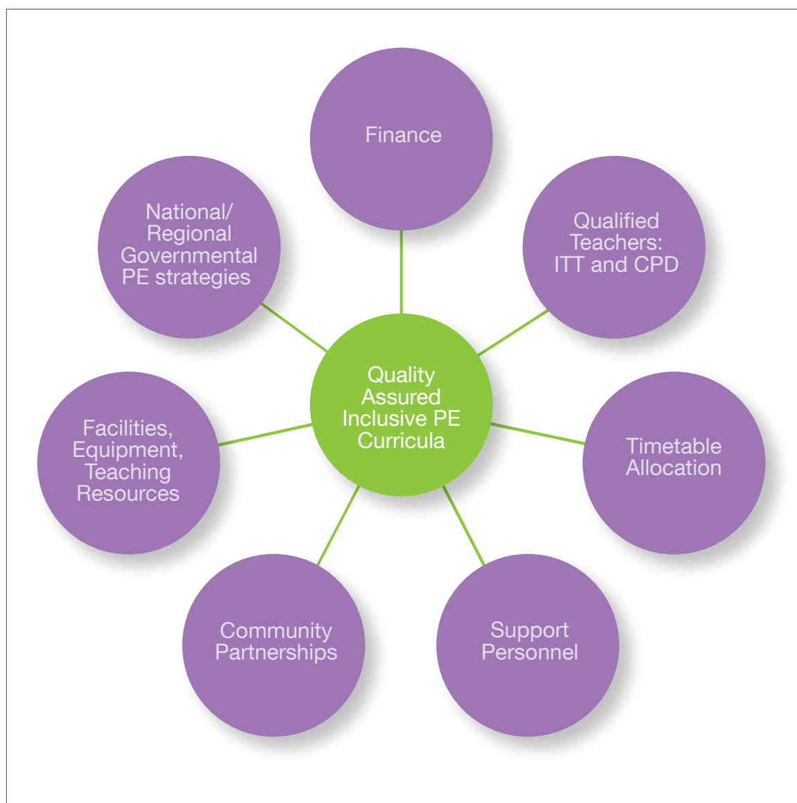
Figure 1. School Physical Education Basic Needs Model: Policy to Practice Infrastructure Template

The main findings of the Survey-generated data relevant to establishing basic needs are presented above in sections 1-7. The analysis of these findings together with analysis of qualitative information derived from items related to issues, concerns or problems as well as to specifically identified essential basic needs' requirements for inclusive quality physical education provision reported in Section 9 serve to provide an evidence-based platform for the formulation of a 'Basic Needs' Model.